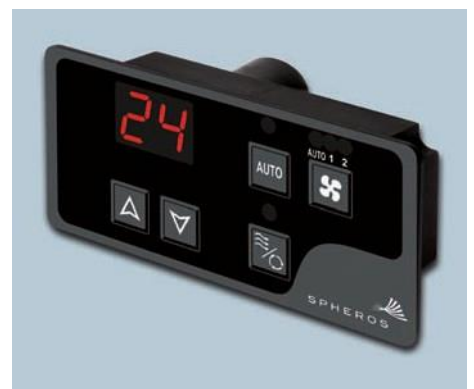
Spheros Control 300