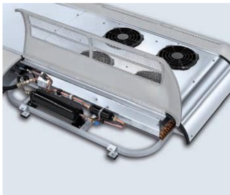
Reliable availability of spare parts and components