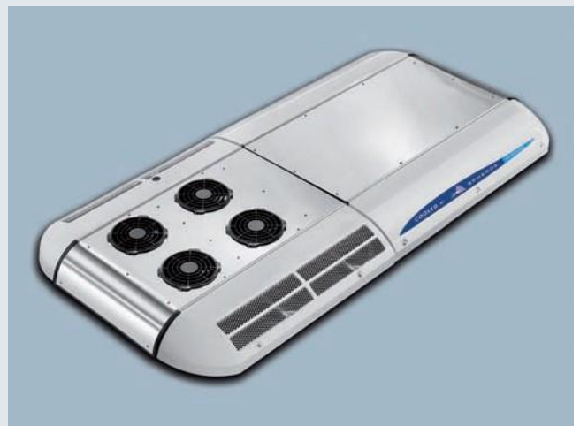
Service: simple, reliable, fast