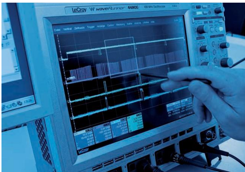
German Engineering: air conditioning test station at Spheros

The result is premium quality, reliable components which are certified on site – after being put through their paces in accordance with stringent German engineering standards.