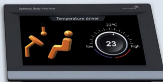
SBI – Control unit and display, the central unit in the modular Spheros Body Interface Concept.