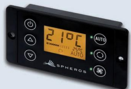
SC 600 – Integrated control at the driver's seat, deployable worldwide.